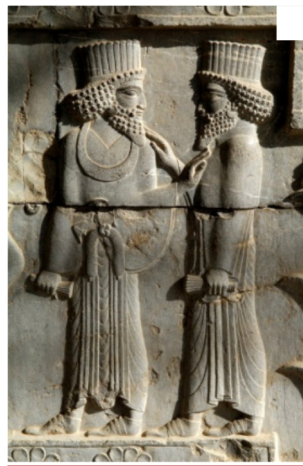
The Achaemenid Empire was the "First Persian Empire" and lasted from 550-330 BC.