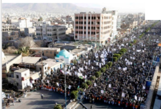
Protesters march in Yemen to show their support of the Houthi rebels, who recently overthrew Yemen's pro-US government.

Through Hezbollah, Tehran dominates Lebanese politics. And our refusal to directly arm the Kurds (as we continue pretending that Iraq can be nursed back to health) drives our only allies amid the Islamic State chaos into the arms of Iran for their own protection.